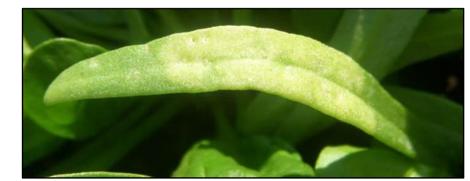
Figure 3. Chlorosis on a cotyledon of a spinach seedling inoculated with an isolate of Peronospora effusa .

Plants are scored as resistant or susceptible based on symptoms of chlorosis ( Figure 3 ) and sporulation of the downy mildew pathogen on the cotyledons ( Figure 4 ) and true leaves ( Figure 5 ). Plants exhibiting any evidence of chlorosis and sporulation are considered susceptible. In a reliable test, a resistant line will have >95% of the plants resistant to the isolate, and the susceptible differential (Viroflay) will have >95% susceptible plants in the test.