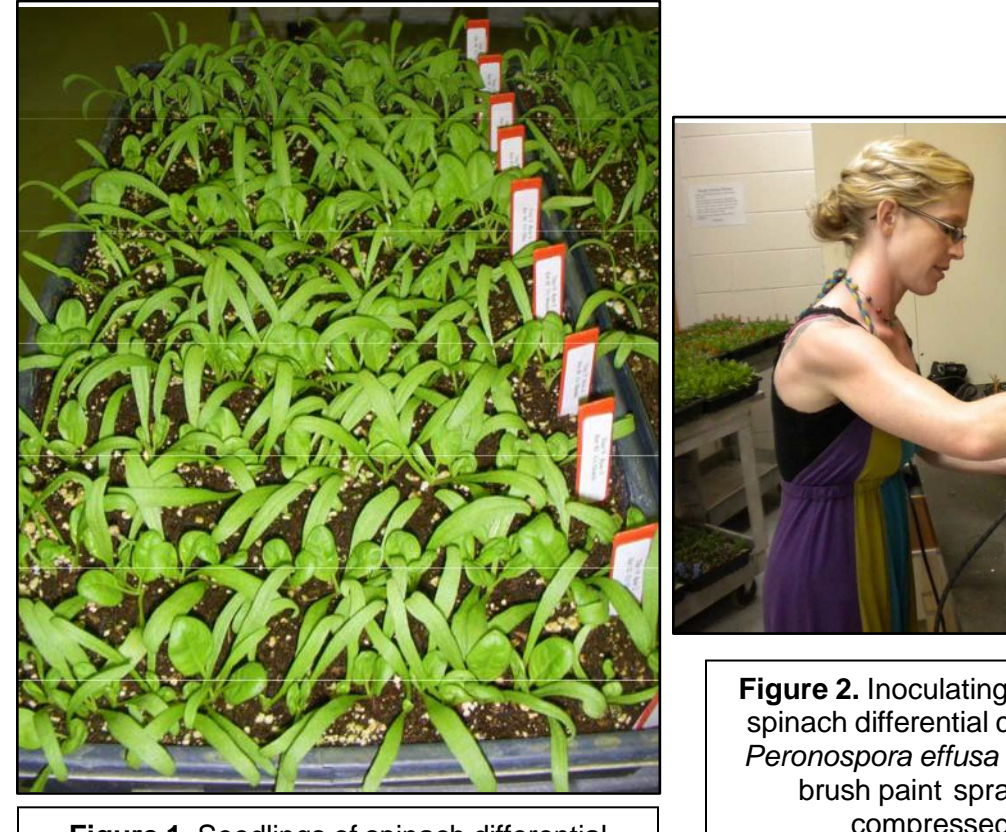
Figure 1. Seedlings of spinach differential cultivars ready for inoculation with an isolate of the downy mildew pathogen, Peronospora effusa.

Spinach is typically planted in a commercial potting mix in 100 cm x 50 cm flats. Twelve differentials (see Table 1 & 2 for the spinach differentials currently used, and reactions of these differentials to the known races of Pe) are grown per tray with approximately 15 plants of a given differential per row. Plants grown under fluorescent lights are fertilized once a week after seedling emergence with Peter's commercial fertilizer (13-13-13). Seedlings are inoculated with a sporangial suspension (2.5 x 10<sup>5</sup> sporangia/ml) of the appropriate isolate of the pathogen at the first true-leaf stage, when the true leaves are approximately 2 cm long (Figure 1). Inoculum is applied using an air- brush paint sprayer with compressed air (Figure 2). Between 10 and 20 ml of inoculum is used to inoculate approximately 150 seedlings per flat.